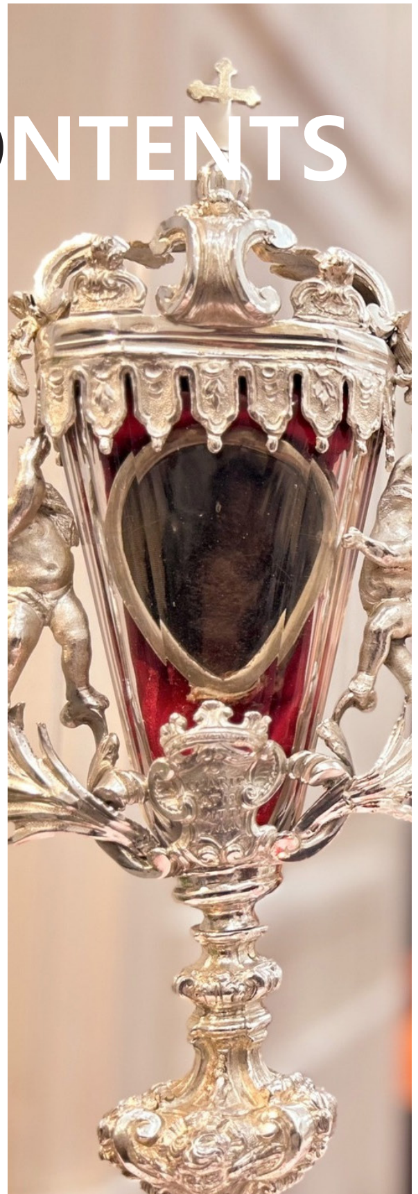
Relic of St. Camillus de Lellis

CADIS advances its community resilience building project in the urban areas of the island of Cebu