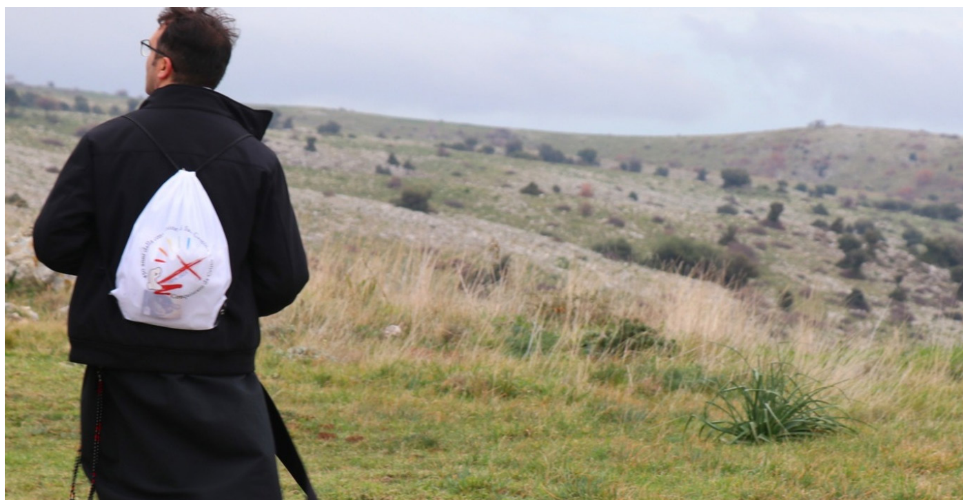
Valle dell'Inferno, Manfredonia