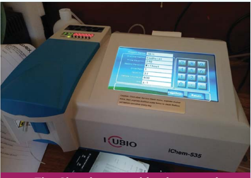
The Chemistry machine in operation

As mentioned above, the facility has a multipurpose scanning machine with four probes which does a wide range of examinations and measurements. The ultra-sound machine does the following; Cardiac echo, scrotal scanning, breast scanning for masses, abdominal and pelvic scanning, endo-vaginal scanning, peripheral vascular, obstetrics etc.