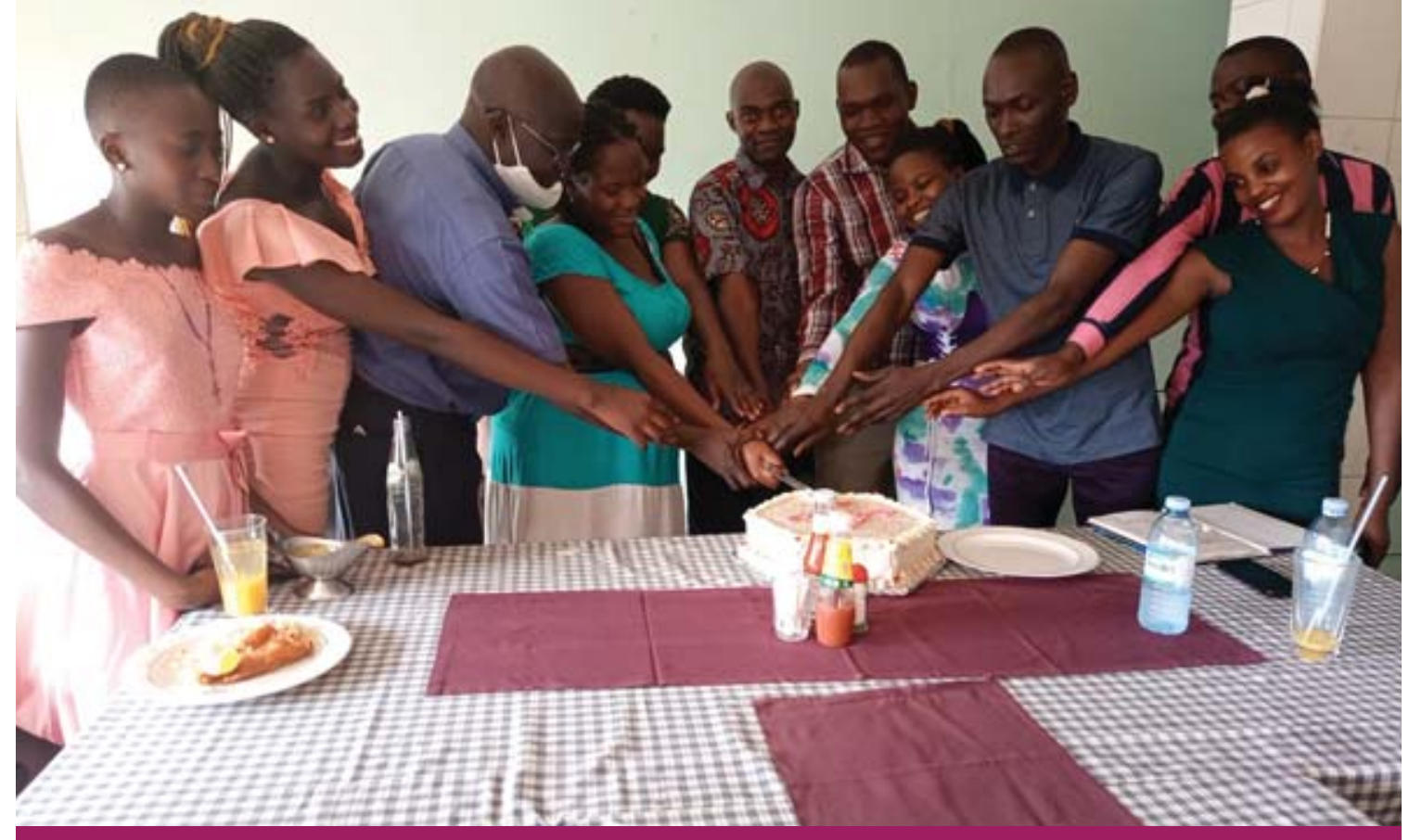
Staffs celebrating charismas party December, 2021