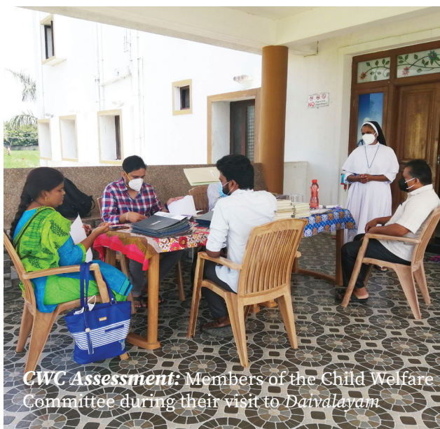
CWC Assessment: Members of the Child Welfare Committee during their visit to Daivalayam