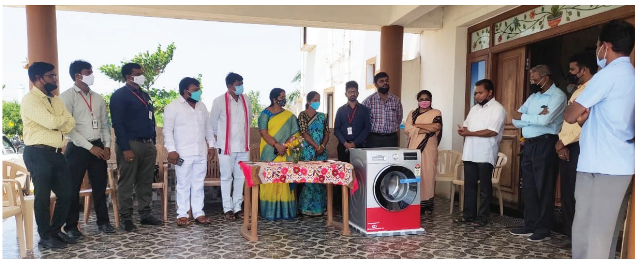
Received with thanks: Muthoot Finance, Secunderabad donates a washing machine to Daivalayam