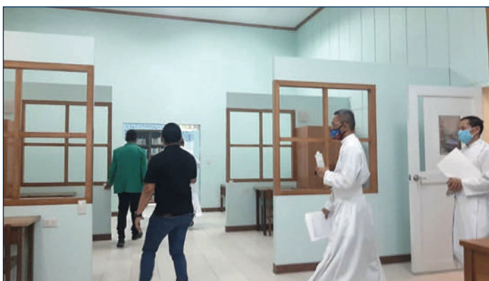
Camillian priests during the blessing of the ward rooms