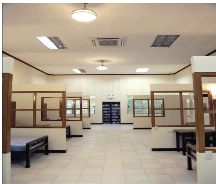
Ward rooms inside the Mansion