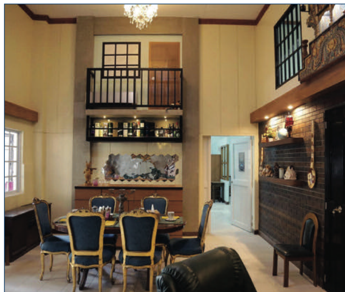
Lobby of the brick house for male residents.