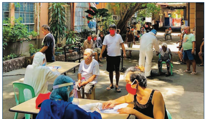
Paco Catholic School