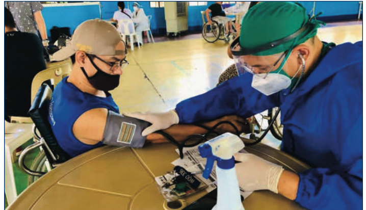
Tahanang Walang Hagdanan