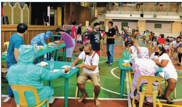
Malate Catholic School