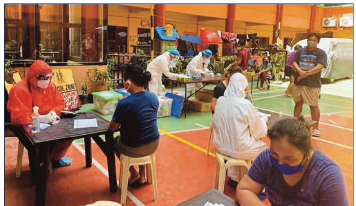
Espiritu Santo Parochial School of Manila