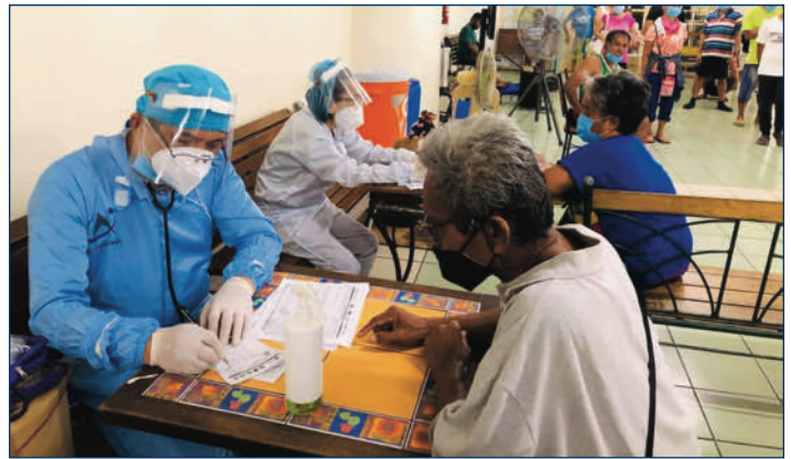
De La Salle University, Taft Avenue, Manila