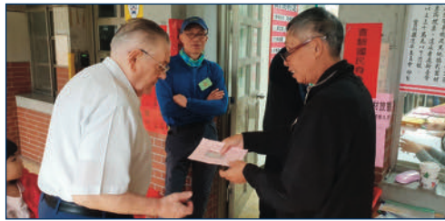
Nov. 23, 2018 – The five Italian religious who received their Taiwanese citizenship last year voted for the first time during Taiwan's national elections.