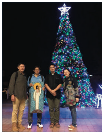
Dec. 1, 2018 – Lighting of the Christmas tree at St. Camillus Shrine